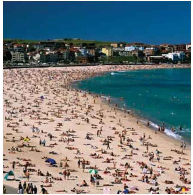
Bondi Beach, Sydney, New South Wales, Australia.