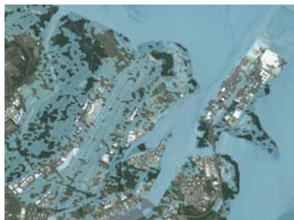
Figure 5.48 Images of Brisbane airport in 2009 and with simulated inundation from a sea-level rise of 1.1 metres using medium resolution elevation data (not suitable for decision-making).