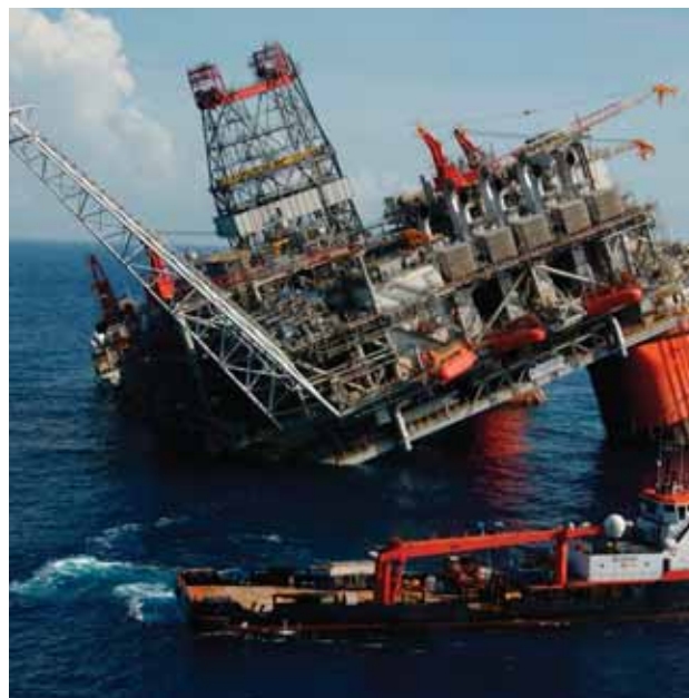
Hurricane-damaged oil rig Thunder Horse, in the Gulf of Mexico 2005, a semi-submersible platform owned by BP, was found listing after the crew returned. The rig was evacuated for Hurricane Dennis.

Exploration work is also disrupted by the passage of severe cyclones. Jack-up rigs conducting exploration drilling on the sea-bed are evacuated as a storm approaches. There are costs associated with closing down a rig and transporting the personnel to a safe location.