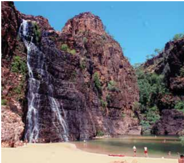
Twin Falls, Kakadu National Park, Northern Territory.