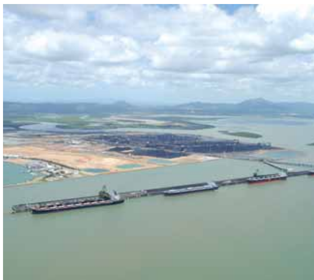
Port of Gladstone.