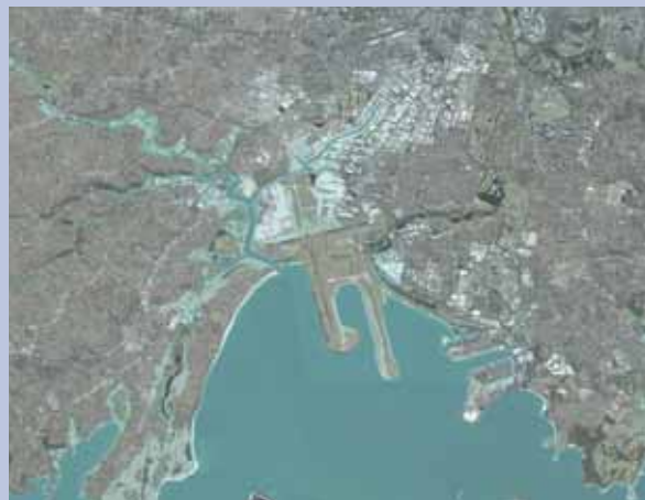
Simulated inundation of Sydney airport for the first half of next century.