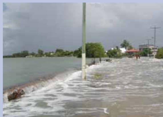
King tide, Sabai January 2009.